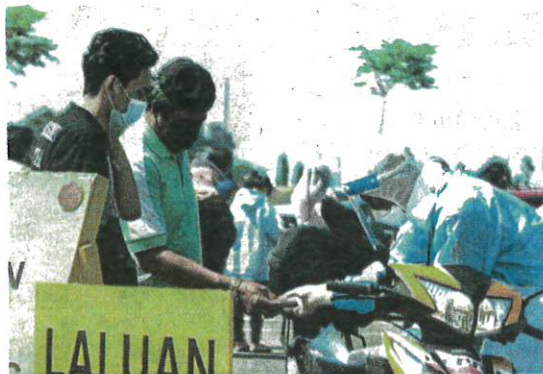
A health officer checking the Covid-19 vaccination registration of individuals in Pasir Gudang yesterday.

He said 261 deaths involved those with underlying illnesses.