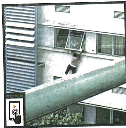
Video tular kejadian di Hospital Sungai Buloh pada 23 Ogos lalu.

SUNGAI BULOH - Permintaan untuk pulang ke rumah ditolak antara punca seorang pesakit Covid-19 bertindak agresif mencederakan petugas Hospital Sungai Buloh sebelum cuba melarikan diri dalam kejadian 23 Ogos lalu.