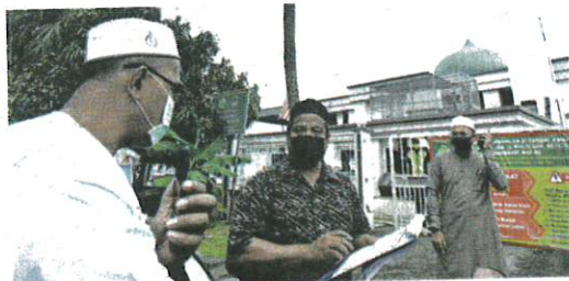
Seorang Jemaah masjid menunjukkan sijil vaksinasi penuh kepada ahli jawatankuasa masjid untuk menunaikan solat Jumaat di Masjid Al Syaikhin, Gombak pada Jumaat.

Ketua Pengarah Kesihatan, Tan Sri Dr Noor Hisham Abdullah berkata, daripada jum-