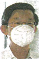
Chow Kon Yeow

Chief Minister Chow Kon Yeow said this could be done by accelerating the vaccination drive in these states, taking public health measures to address the spike in infections and ensuring public healthcare facilities were adequate to meet the rise in cases. "And also bearing in mind the