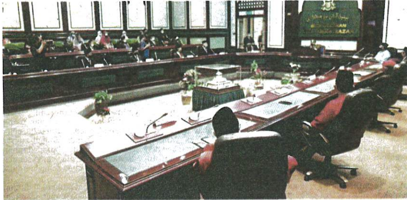
Tunku Ismail berkenan menerima menghadap guru yang menolak vaksin COVID-19, di Bangunan Sultan Ibrahim, Bukit Timbalan, semalam.

"Baki 383 guru lagi mengambil pendirian untuk menangguk pengambilan vaksin buat masa ini kerana mempunyai alahan, mengandung ataupun keadaan kesihatan yang tidak mengizinkan.