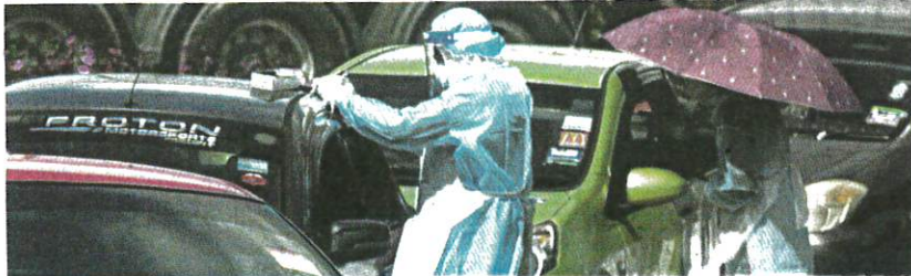
Kakitangan jabatan kesihatan merekod maklumat individu di perkhidmatan pandu lalu di Pusat Sehati Penilaian COVID-19 di pekarangan Stadium Tertutup Pasir Gudang, semalam.