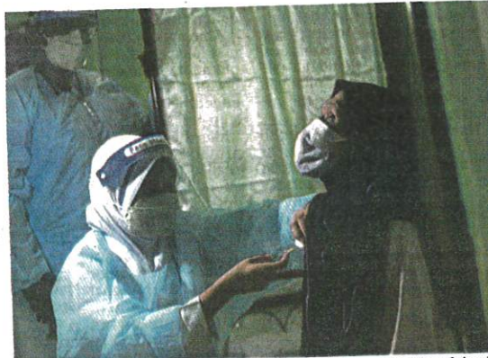
A woman receives a vaccine dose during a mobile vaccination drive in Bukit Mertajam on Thursday.

"I hope the vaccine contribution will accelerate the Covid-19 National Immunisation Programme